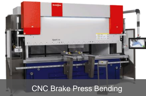
CNC Brake Press Bending