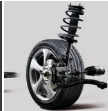
Heavy-duty suspension and brakes