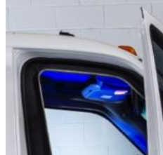
INKAS® overlap system