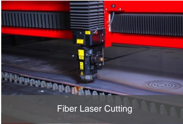
Fiber Laser Cutting

INKAS® employs the latest line of CNC cutting and bending machines supplied by the world leader in steel processing systems. Implementation of latest technologies in laser cutting and bending, which don't affect the metal structure, results in our ability to supply armored vehicles that guarantee safety and security