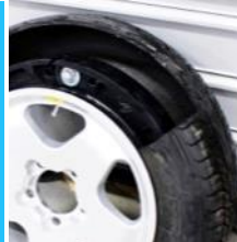
Run-Flat Hutchinson Tires